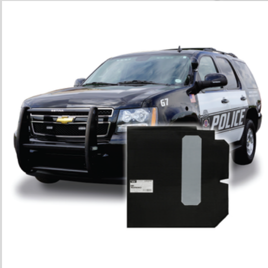
Lightweight armored door panels